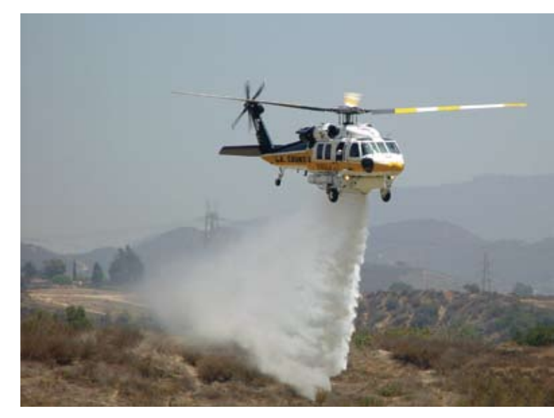
Firefighting demonstrations showcase the capability of the helicopter and excite the thousands of spectators who attend the Heroes shows every year.

PROMISE" Emergency Preparedness Fair provides city, county, state, and federal agencies an opportunity to showcase community emergency preparedness information on how to respond to and recover from natural disasters of all kinds.