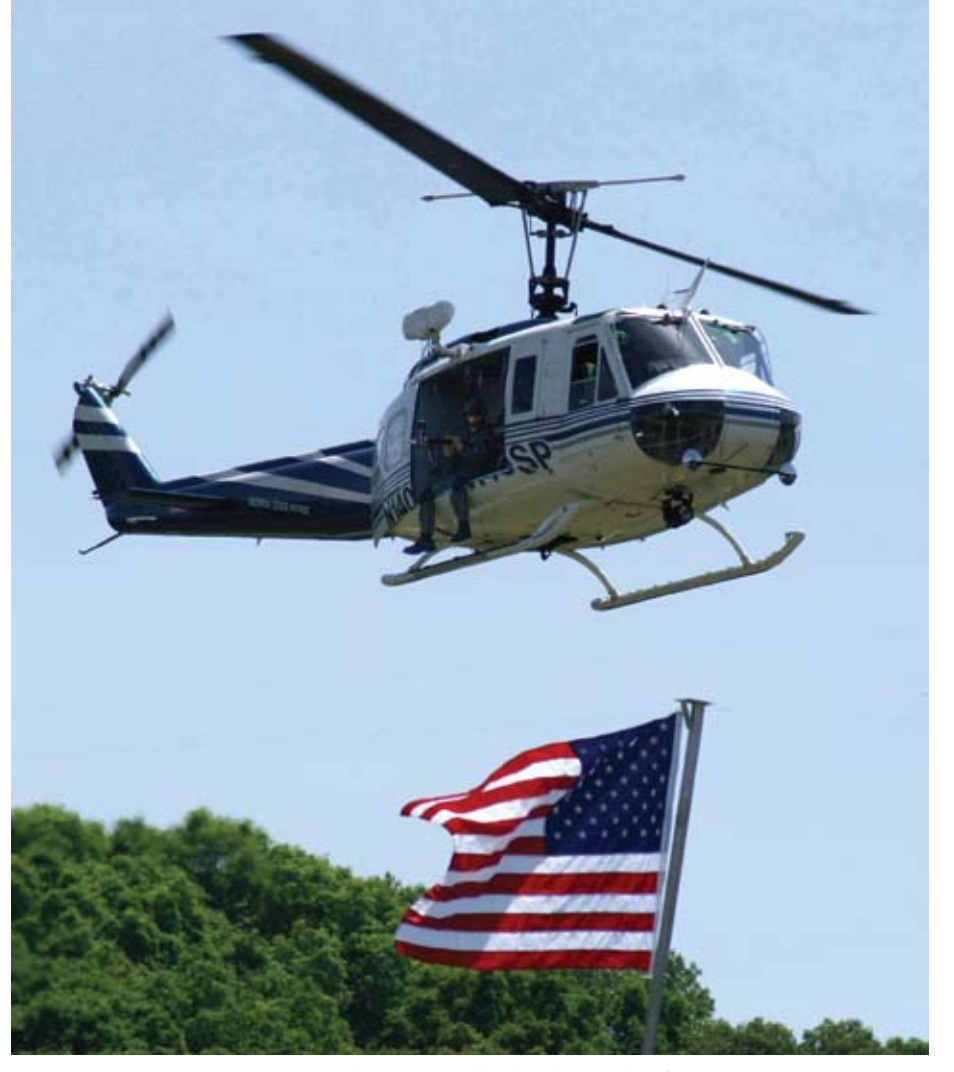
American Heroes shows typically blend a touch of patriotism into the flight demonstrations and displays.

There are no hard figures — since none of the Heroes shows ever charge admittance fees — but it is estimated that somewhere in the neighborhood of 40,000 people attended the shows in 2008.