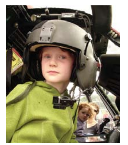
Heroes shows are family oriented events with something for everyone and provide a great opportunity to introduce children and adults to aviation and public service.

What is in the future for AHAS? American Heroes Air Show has shown dramatic