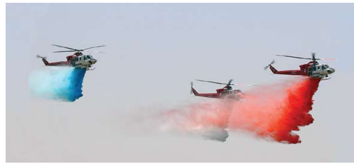
The red-white-and-blue firefighting water drop is always a big hit at the Los Angeles Heroes event.